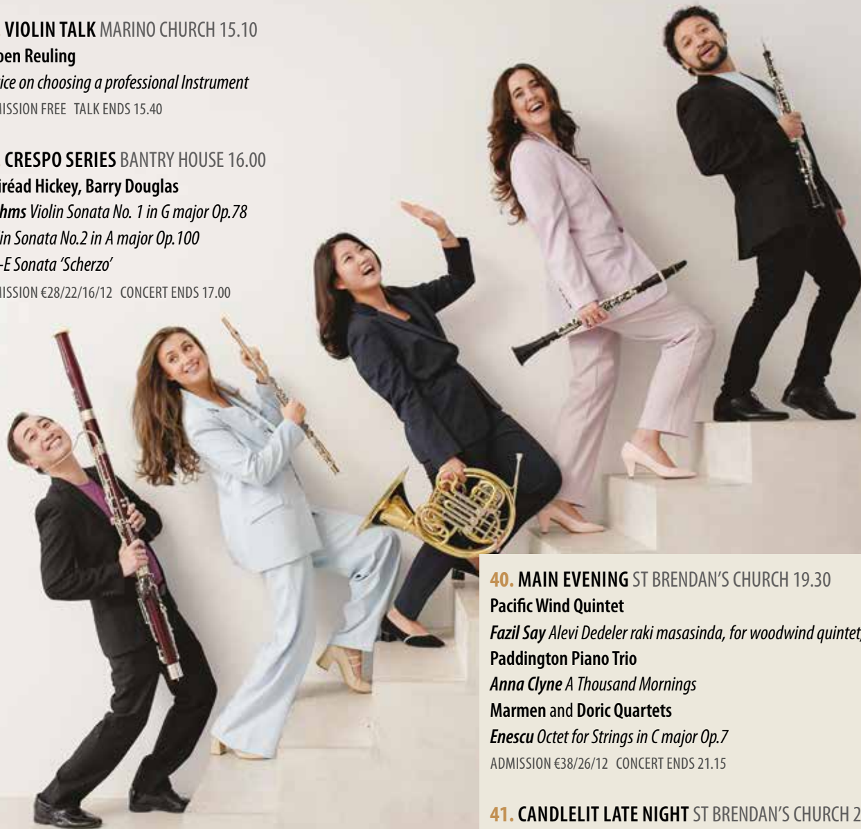
Pacific Wind Quintet

ADMISSION €28/22/16/12 CONCERT ENDS 17.00