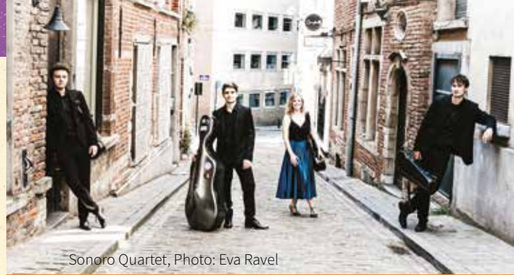
Sonoro Quartet

Founded in 2019, Sonoro Quartet is one of the leading young string quartets of its generation. Hailing from France, Ireland and Belgium and performing over 40 concerts annually, their repertoire encompasses classical masterpieces alongside works and commissions by contemporary composers.